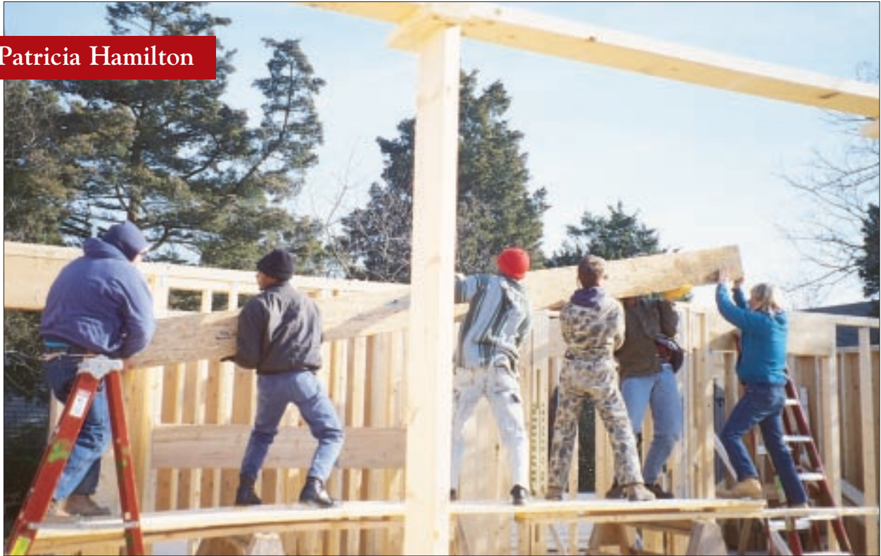
A Parallam beam is heavier than an equivalent-strength steel I-beam. The author's crew lifts beams up to 16 feet by hand; beyond that, they use a crane.

A s builders of custom oceanfront homes, we use a lot of long structural beams. Whenever we build on pilings, as we often do, we use girders to transfer loads to the pilings. Also, increasingly, the architect-designed custom homes we build feature large open spaces and complex roofs that require heavy beams. Anytime the structure of a house requires something stronger, shallower, or longer than we can accomplish with three or fewer 2x12s, our beam of choice is Parallam.