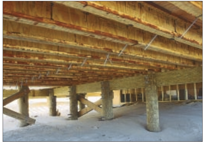
Parallam comes pressure-treated for exposed conditions. Recently treated beams may vary in size, but will eventually shrink back to the same dimension.

Compared with glulams, which have comparable strength, Parallam is somewhat more available in our market (see “Parallam vs. Glulam & Steel”). For an exposed beam, however, architectural-grade glulam is still the best option.