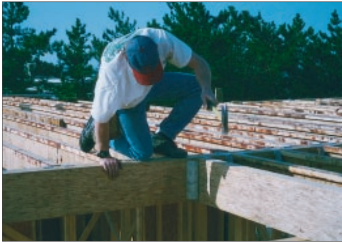
Unlike steel, Parallam integrates easily into a wood-frame structure, requiring only standard carpentry tools.