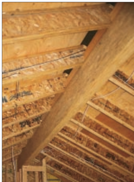
For a ridge beam, the author saves time by using a single piece of Parallam rather than laminating a multiple-member LVL beam.

Parallams are perfect for flush-framed floor beams. Single-member