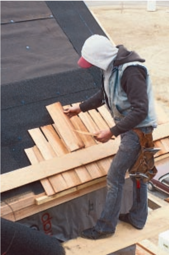
Figure 2. Tacking a 1x6 “exposure guide” flush with the bottom of every shingle course makes it easy to position and fasten the next course.

joints are offset at least 1½ inches from joints in the course below. Since wet shingles expand, we leave a ¼-inch gap between each shingle to accommodate this movement and prevent the shingles from buckling and cracking.