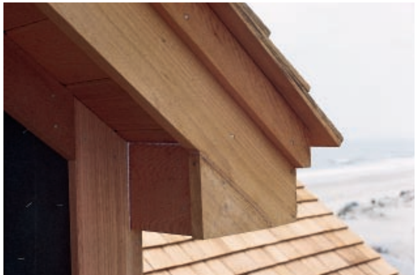
Figure 3. A 1x2 trim board held ¾ inch higher than the roof sheathing hides the edge of the Cedar Breather.

As we’re installing the “field” shingles, we make a point to cull out plenty of wide shingles for use as cutting stock at the valleys. When we install the valley shingles, we hold the nails back at least 12 inches from the center of the valley.