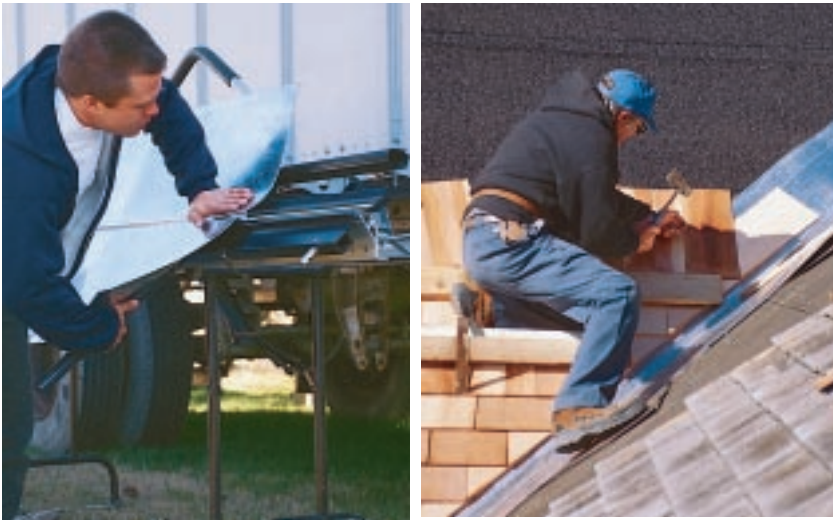
Figure 4. The author's crew forms the lead-coated-copper valley flashing with a 10-foot brake (left). The inverted V in the center of the flashing directs runoff down the valley. When attaching valley shingles, nails are held at least 12 inches from the center of the valley (right).