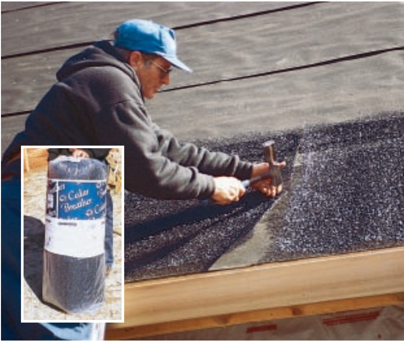
Figure 1. A 3/8-inch-thick layer of Cedar Breather (inset) laid over solid sheathing and felt paper allows the wood shingles to dry from underneath.

in the house by covering the sheathing with 30-pound felt paper, overlapping the seams at least 3 inches.